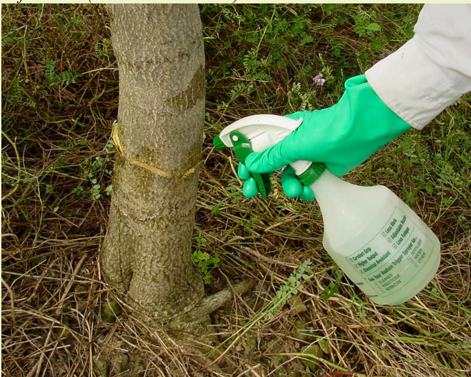
Figure 5. A late-season hack-and-squirt treatment (spaced cuts) provides control of root suckering species such as tree-of-heaven ( Ailanthus altissima ).

With just a few products and the application techniques at your disposal, you can use herbicides to treat problem vegetation any time of year. Even inexperienced staff can accomplish a lot, as just a few herbicides provide you the latitude to control almost any plant species.