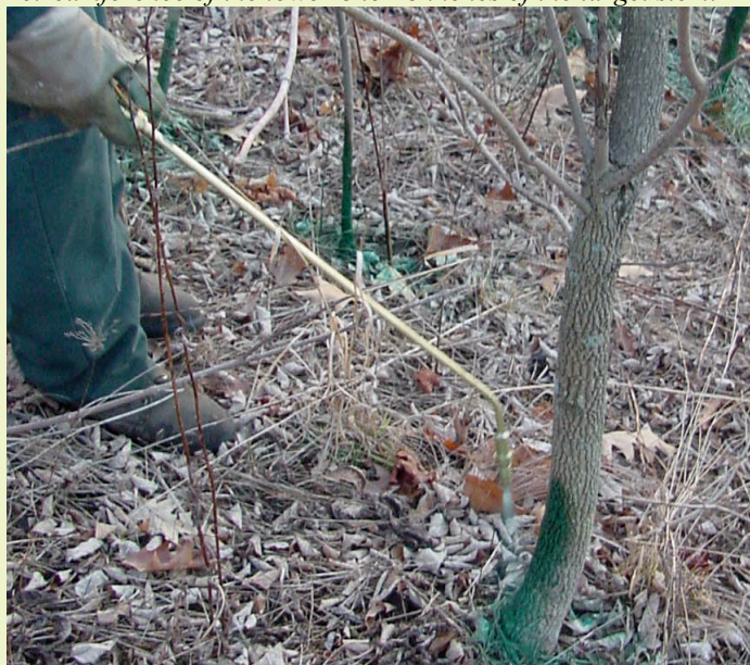
Figure 4. A basal bark treatment is applied to the complete circumference of the lower 8 to 18 inches of the target stem.

to-use 'Pathfinder II' is applied to woody stems as a basal bark or stump treatment. There is an oil-soluble concentrate, 'Garlon 4 Ultra', that can also be mixed in water. This product can be applied to foliage, and to woody stems as basal bark or stump treatment. This product does not have aquatic labeling