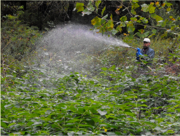
Figure 2. A high-volume foliar application is useful for tall or dense targets such as this Japanese knotweed ( Fallopia japonica ). This application allows more productive coverage because the spray pattern can be thrown farther than with a low-volume backpack application.