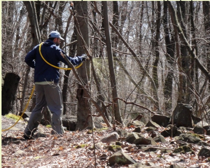
Figure 3. A preemergence treatment is being applied in early spring to prevent establishment of the annual weed mile-a-minute ( Persicaria perfoliata ). The handgun is equipped with a 'turf' nozzle that produces a showerhead-type spray.

Stump treatment will vary based on whether you are using water-based or oil-based treatments. When using water-soluble herbicides such as 'Rodeo' ( glyphosate ) or 'Triclopyr 3' ( triclopyr ), you should treat as you are cutting. If you wait too long, the cut desiccates; and if done during the growing season, the plant begins to 'seal'