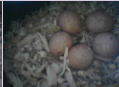
Eggs at St.Micheal's Preserve's nesting box