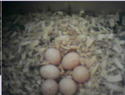
Nest inhabited with eggs on a Private Member's Land