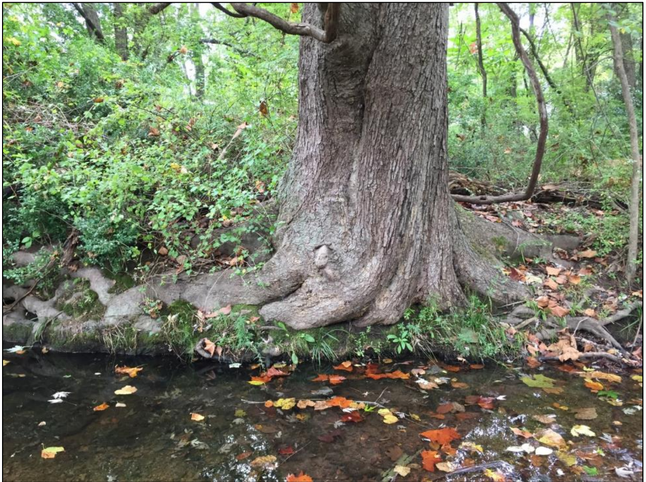
Very large Silver Maple with roots anchoring a tributary of the Stoney Brook in Howe's Woods