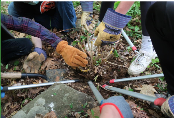
Forest Stewards collaborate to remove barberry root

Miracles do not happen overnight. However, each Sunday morning when a group of 15–18-year-old teens show up, leave their phones in their pockets, and pick up loppers and shovels to work hard in the woods -- it feels like one. The loppers are used to cut invasive barberry, burning bush, and bittersweet. Shovels are used to dig out the roots. These students are part of Ridgeview Conservancy's Youth Stewardship Program, a collaboration with Princeton High School and other local schools. Students work year-round in cold, heat, mud, and snow. During one of their first meetings the group discovered a box turtle – a species of special concern in New Jersey. With looks of reverence, the students gently took turns holding it. Since that day, the name of the forest stewards was born – Ridgeview Turtles .