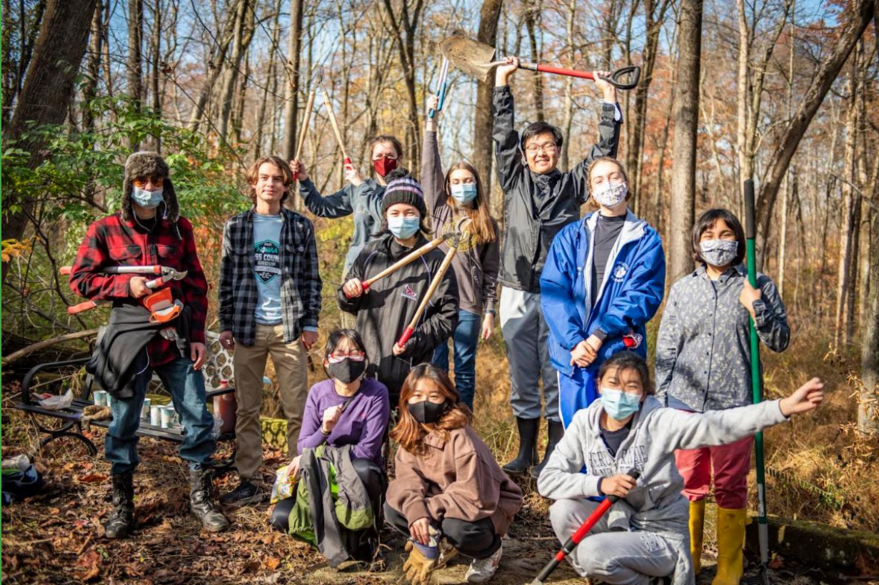
Invigorated after removing invasives

Miracles do not happen overnight. However, each Sunday morning when a group of 15–18-year-old teens show up, leave their phones in their pockets, and pick up loppers and shovels to work hard in the woods -- it feels like one. The loppers are used to cut invasive barberry, burning bush, and bittersweet. Shovels are used to dig out the roots. These students are part of Ridgeview Conservancy's Youth Stewardship Program, a collaboration with Princeton High School and other local schools. Students work year-round in cold, heat, mud, and snow. During one of their first meetings the group discovered a box turtle – a species of special concern in New Jersey. With looks of reverence, the students gently took turns holding it. Since that day, the name of the forest stewards was born – Ridgeview Turtles .