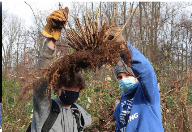
Barberry root - medicinal, but invasive

Ridgeview Turtles learn to distinguish invasive from native species and clear invasives to create trails in recently preserved forests, many of which are impenetrable thickets. The forests the students work in are part of Princeton's Emerald Necklace initiative, a ring of interconnected woodlands encircling the town to ensure the healing power of green is accessible to all. The goal is not just to remove invasive species to make trails from A to B. Trails are designed to pass by intriguing features and create enchanting "rooms" such as Wolf Hollow, Holly Haven, Triplet Tulips and Turtle Rock so that visitors can learn to "read" the landscape and boost their ecological literacy.