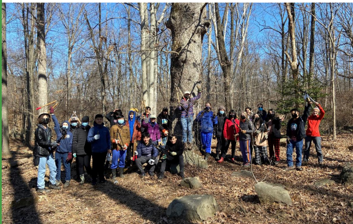
25 Youth Stewards after liberating a grand white oak from multi-flora rose

Miracles may not occur overnight. However, after a decade of being meticulously coaxed by the hands of high school students, the return of blood root, May apple, Solomon's seal, and fairy spuds – feels like one!